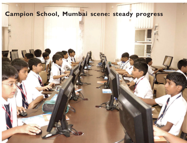
Campion School, Mumbai scene: steady progress

T HE NOTABLE FEATURE OF THIS YEAR'S WESTERN REGION day schools league table headed again by Cathedral and John Connon, Mumbai is a churn in the Top 5 list. Campion, Mumbai has overtaken Bombay Scottish to be ranked second and the Ahmedabad-based Riverside School unranked in the previous two years has made a spectacular entrance into the Top 5 shortlist followed by Ryan International School, Goregaon, Mumbai at No.6. The Top 10 list also includes St. Mary's, Mazgaon, Mumbai (up from No. 11); St. Xavier's (8), and J.B. Petit (10), all Mumbai-based institutions. At No.9 is the previously unranked Ahmedabad-based Eklavya . Indeed, except for the two Ahmedabad-based schools, the western region Top 10 table is crowded with Mumbai schools.